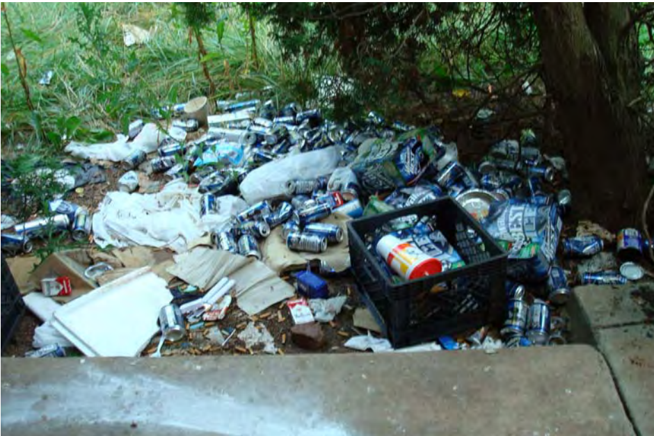
A small sample of trash before HSM volunteers cleaned up at the Alt-Med property.