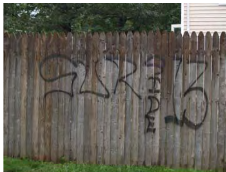
Examples of gang graffiti in the Yorkshire area before HSM's Community Action Program springs into action.